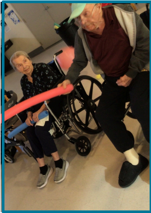
Noodle Hockey Games